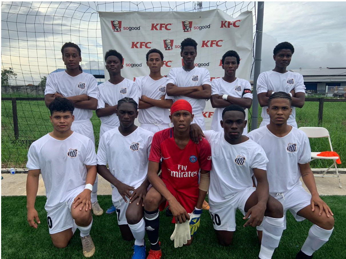
Santos FC – National Champions

The National Play-off was conducted over the period June 15 – July 7, 2019 at NTC, Providence. RMA winners and second place clubs were invited to the play-off, with the exception of the EC/P FA, RFA and Bar. FA, where only the winning clubs were invited because of the exorbitant transportation cost to bring both clubs to Georgetown.