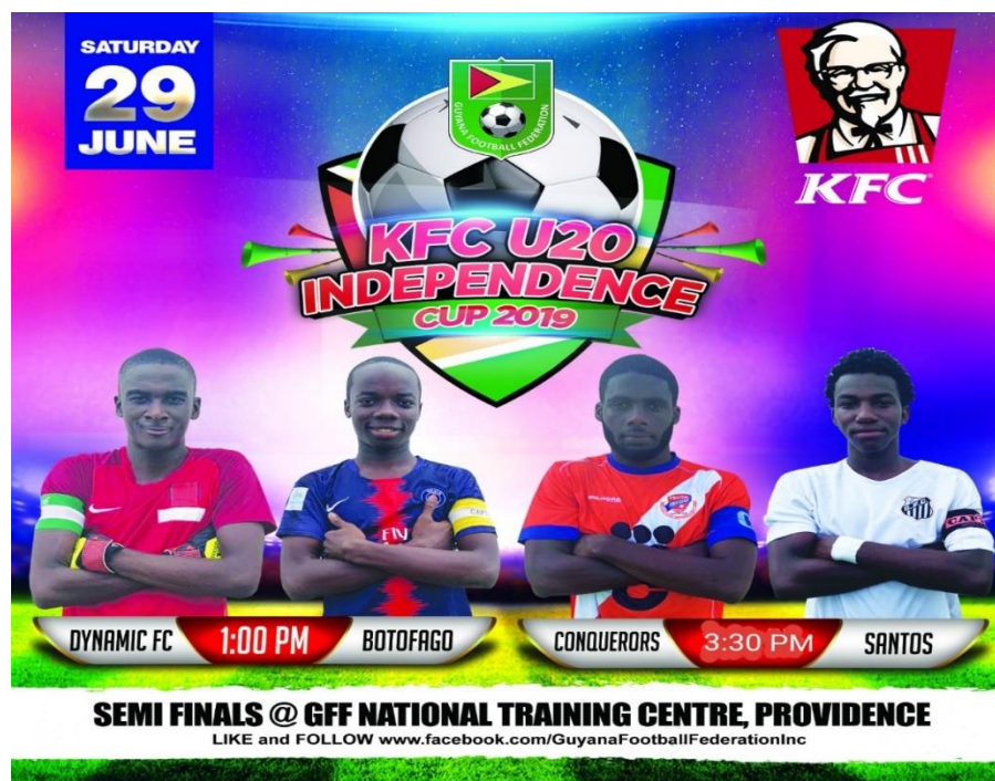
National Play Off semifinals