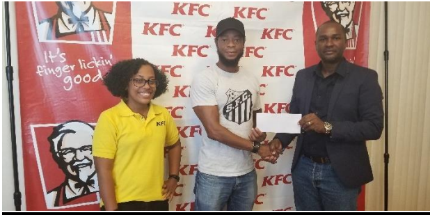
Santos FC VP receiving First Prize Cheque