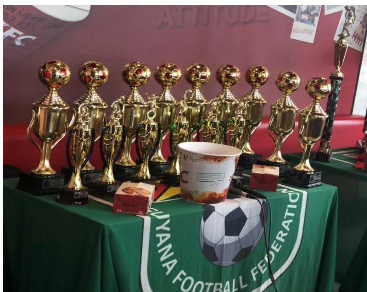
Trophies for the Intra-Association Phase

This phase was then followed by the National Play-off at the National Training Centre, featuring all of the RMA champion clubs.